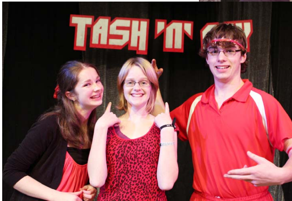
Our brave juniors The Red Team