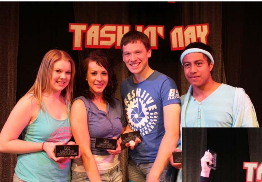
Our winning team The Hi-4s